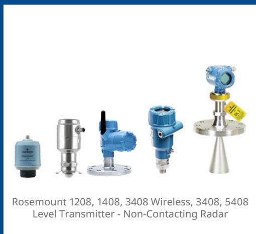
Rosemount 1208, 1408, 3408 Wireless, 3408, 5408 Level Transmitter - Non-Contacting Radar