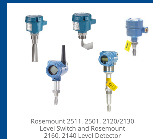
Rosemount 2511, 2501, 2120/2130 Level Switch and Rosemount 2160, 2140 Level Detector