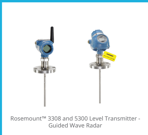
Rosemount™ 3308 and 5300 Level Transmitter - Guided Wave Radar