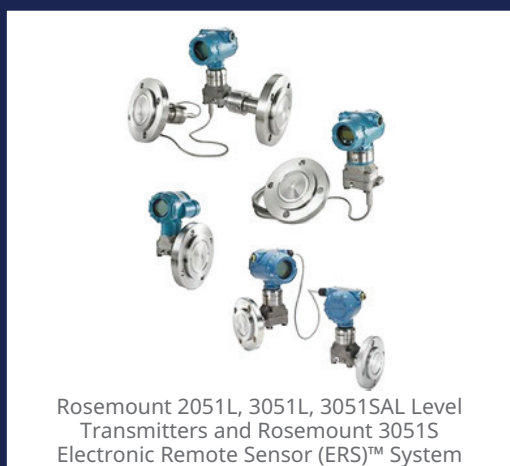
Rosemount 2051L, 3051L, 3051SAL Level Transmitters and Rosemount 3051S Electronic Remote Sensor (ERS)™ System

Connect to virtually any process with a comprehensive offering of seals, fill fluids, and materials.