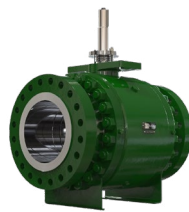
Fisher V280 pipeline ball valve