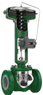
Fisher easy-e™ control valve with FIELDVUE™ digital valve controller

Pipeline transportation and CO 2 sequestration require consistently high pressures to be efficient and cost-effective. Emerson has a host of environmental control valve packing types suitable for use in high-pressure applications to mitigate CO 2 emissions.