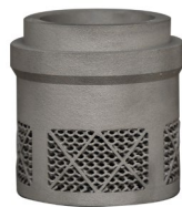
Fisher Whisper™ NXG control valve trim