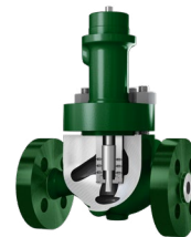
Fisher HP control valve with Cavitrol™ III cage